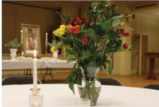
Roses, candles and religious images set a quiet and prayerful tone for a SEEN gathering.

"The name 'SEEN' is important because very often, nobody knows what happened. The parents hold it inside," she explains. "But we're here to affirm the dignity of the life lost. As Catholics, we believe that life begins at conception, and every soul has meaning and purpose."