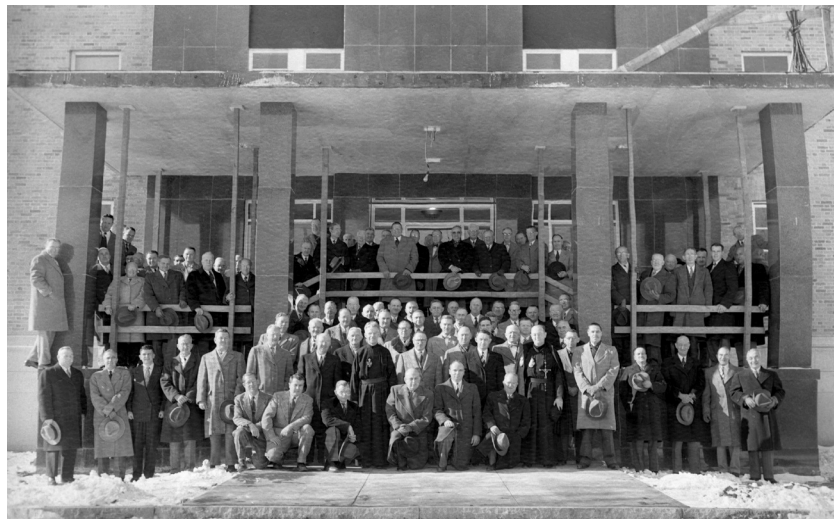
Priests and Catholic retreatants gather for the very first retreat Feb. 2 to 4, 1951, at the Holy Family Passionist Retreat Center in West Hartford.

For updates on these and other anniversary events, visit holyfamilyretreat.org/calendar-of-events .