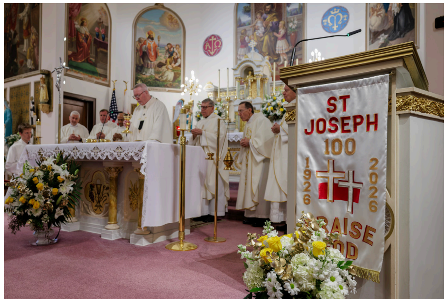
A special flag, Praise God, was designed for the anniversary.