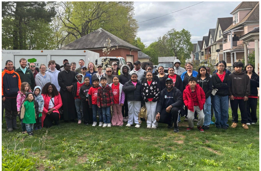
In April, hardworking volunteers of St. Justin-St. Michael Parish helped add new greenery to the church and rectory grounds. They pause for a photo after doing their work.